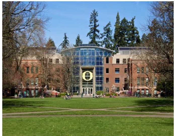
University of Oregon Campus