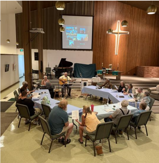
A recent worship service at Emerald