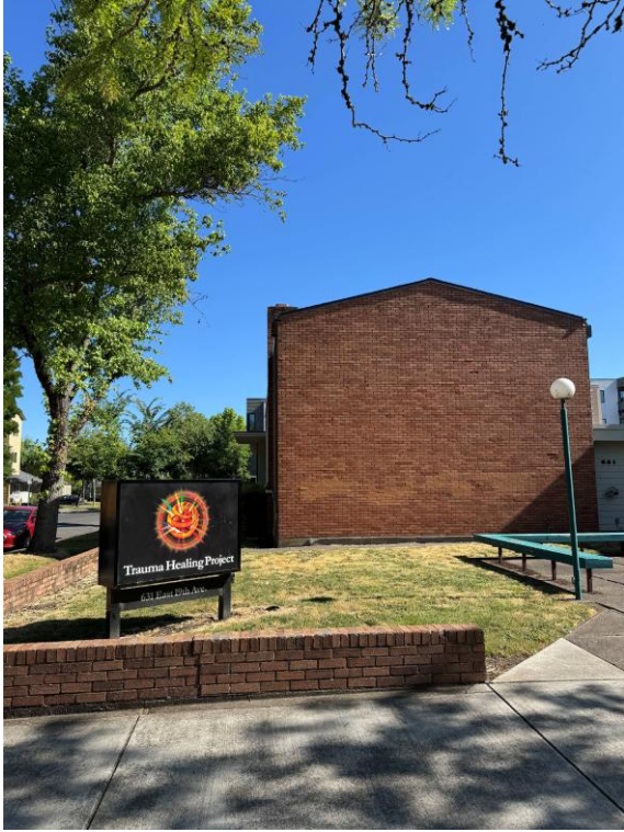
Trauma Healing Project building