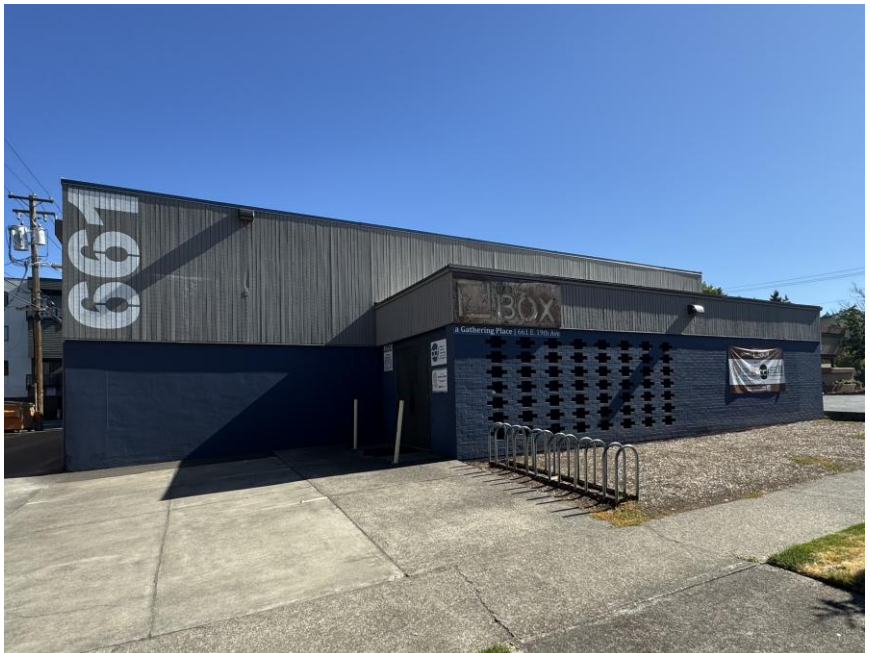
City Salt Church uses The Box for their services