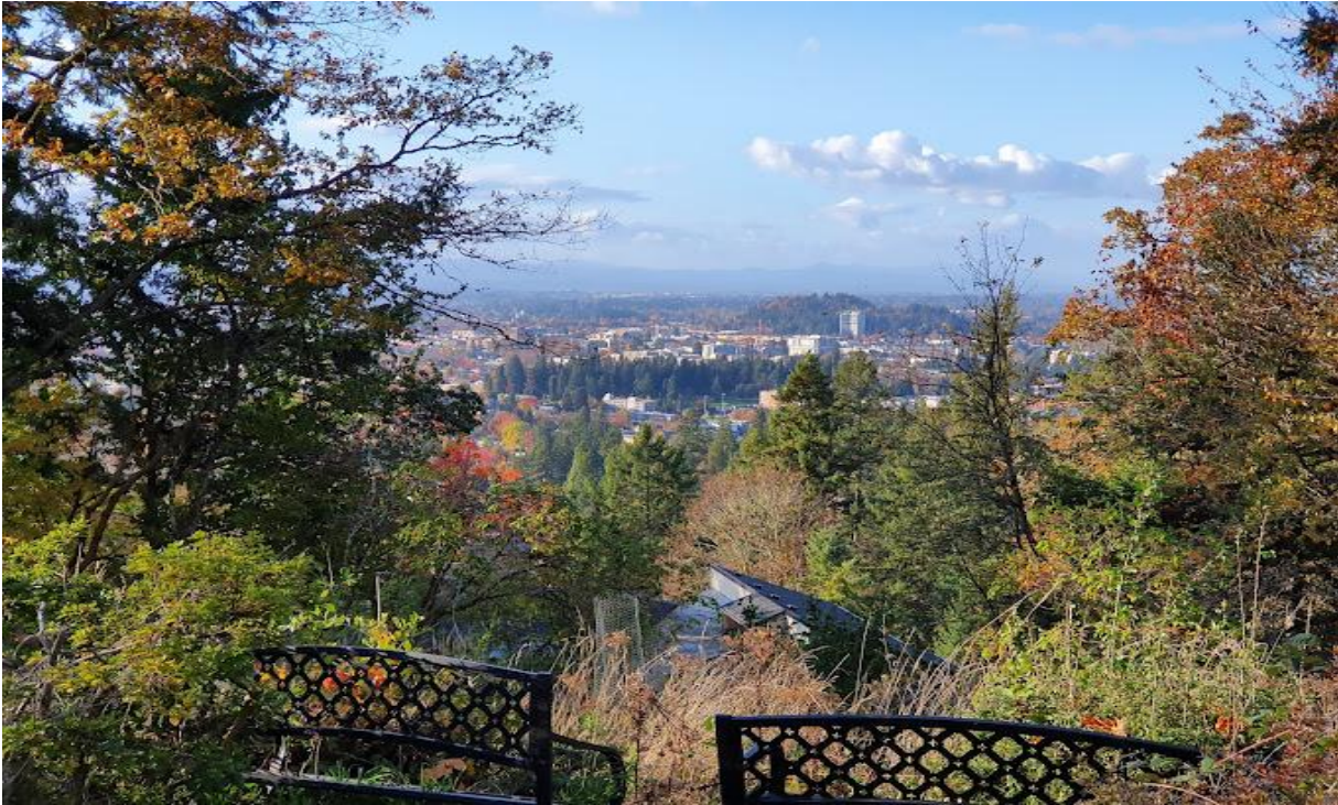
Looking over Eugene from south hills